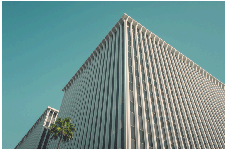
Dawn InfoTek_Code of conduct_v2023